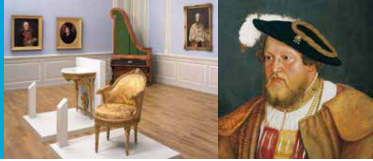
Pfalz-Neuburg museum (l.); Count Palatine Ottheinrich (r.)

Dr. Markus Söder, MdL Bayerischer Staatsminister der Finanzen, für Landesentwicklung und Heimat