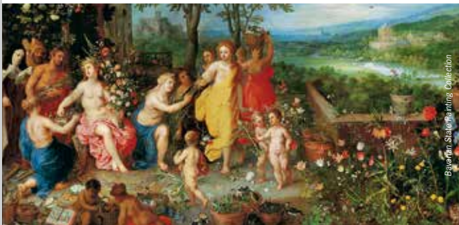
Bavarian State Painting Collection

'The Season of Spring' from the 'Four Seasons' series, Jan Brueghel the Elder and H. van Balen, 1616