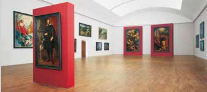
Main room in the State Gallery with Rubens altars