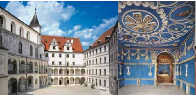
Main courtyard at Neuburg Palace, with sgraffito decoration on the façade (l.); Baroque palace grottos (r.)

Neuburg Palace on the banks of the Danube was once the residence of the principality of Pfalz-Neuburg, founded in 1505. This impressive palace complex, with its four mighty wings enclosing an arcaded courtyard, was built on the site of a late-Gothic ducal castle. Work started on the three splendid Renaissance wings in 1530, under Count Palatine Ottheinrich (1502–1559), the first sovereign of Pfalz-Neuburg and later Palatine Elector. His successor, Count Palatine Wolfgang von Zweibrücken, commissioned the Dutch master Hans Schroer to decorate the courtyard façade. Carried out between 1560 and 1569, these Biblical scenes in sgraffito technique are one of the special attractions of the palace. Count Palatine Philipp Wilhelm of Pfalz-Neuburg added the Baroque east wing and the two dominant round towers between 1664 and 1668, turning the palace into one of the very first Baroque palaces in Germany. Other highlights include the wall and ceiling paintings (1543) by Hans Bocksberger in the palace chapel, the first ever Protestant church interior, the Renaissance Knights' Hall with its wood panelling and the Baroque palace grottos.