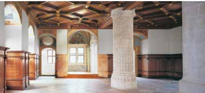
Nymphenburg porcelain cup with a Portrait of Duchess Maria Amalia (top); Knights' Hall with wood panelling (below)

The former residential and state rooms of Neuburg Palace now host an impressive display of the history of this principality. 550 works of art – portraits and valuable tapestries, weapons, furniture and precious craftwork – bear witness to this exciting chapter in Palatine-Bavarian history.